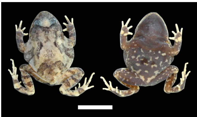
FIGURE 1. Zachaenus carvalhoi (MNRJ 55841) from the Parque da Lajinha, municipality of Juiz de Fora, state of Minas Gerais. Scale = 1 cm.

Recently, we had the opportunity to examine specimens of Zachaenus deposited in the Amphibian Collection of Museu Nacional, Universidade Federal do Rio de Janeiro (MNRJ). Three specimens of Z. carvalhoi (MNRJ 55841-3) (Figure 1), were found collected in Parque da Lajinha, Municipality of Juiz de Fora, state of Minas Gerais, between October and November 2006. The specimens examined were determined based on original description and comparison with one paratype (MNRJ 4169) (Figure 2).