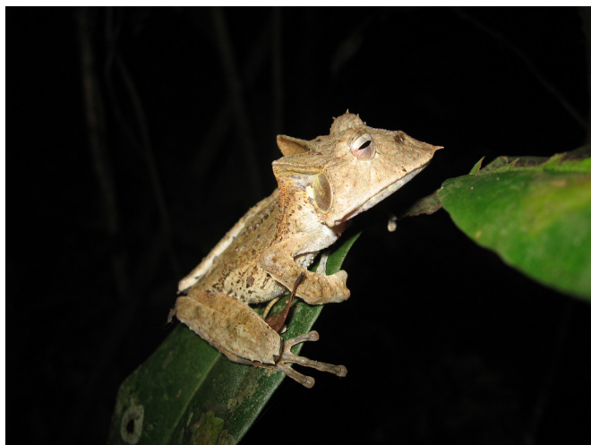
FIGURE 1. Specimen of Hemiphractus helioi found on the vegetation (1 m above ground) at night on 13 November 2008 in Mõa River forest, municipality of Cruzeiro do Sul, Acre, Brazil.

These new records from the lowland forest of Mõa River in Cruzeiro do Sul extended the range of this species about 100 km to the east (Figure 3) from the nearest collection site known in Parque Nacional da Serra do Divisor (Souza 2009).