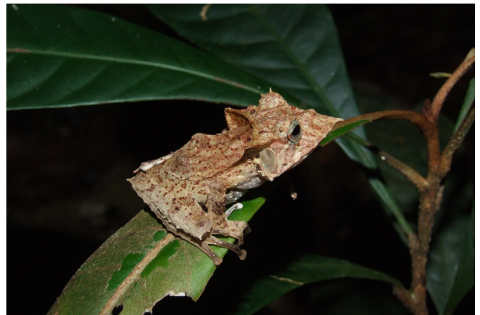
FIGURE 2. Specimen of Hemiphractus helioi found on the vegetation (40 cm above ground) at night on 15 December 2008 in Mõa River forest, municipality of Cruzeiro do Sul, Acre, Brazil.