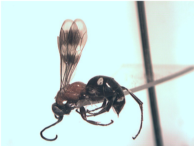
FIGURE 3. Epipompilus aztecus (Cresson, 1869)

Our record expands the distribution of E. aztecus to South America, bringing new perspectives to the biogeography of spider wasps.