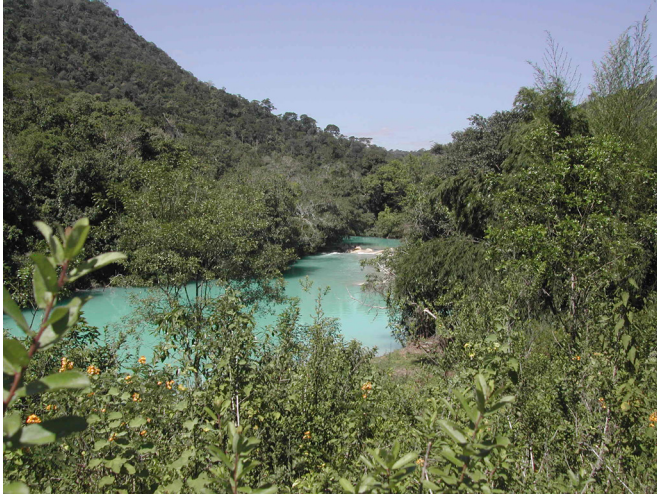
FIGURE 2. Riparian Forest along the Salobra River, Serra da Bodoquena, state of Mato Grosso do Sul, Brazil.

deciduous forest fragments are remnants of a previously broad distribution in the Americas during the dry Pleistocene. In the region of Bodoquena Mountain Range, there is one of the last large remnants of deciduous seasonal forest in Brazil (Pott and Pott 2003). Morrone (2006) believes that the biotic components represent a primary stage of biogeographic homologies, and the presence of some taxa indicates space-temporal relationships in the evolutionary history.