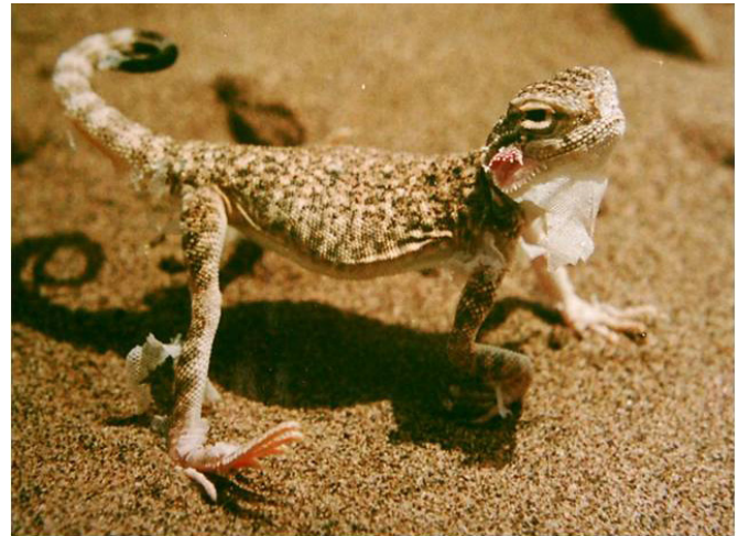
FIGURE 3. Phrynocephalus mystaceus in natural sandy habitat.

In all specimens studied, there is a greatly enlarged scale (equal to about four adjacent scale) on each side of thorax behind maxilla and occasionally an additional scale or two slightly smaller adjacent to it. This property