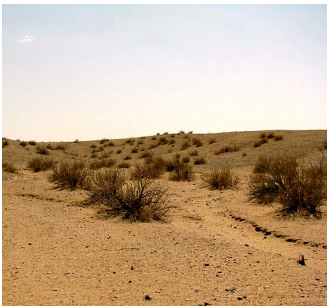
FIGURE 1. Habitat of Phrynocephalu smystaceus .

Calculation of mean, minimum, maximum, standard deviation; coefficient of variation in both male and female were implemented separately using SPSS Ver. 16.0.1 statistical package (SPSS Inc., Chigaco, IL, USA).