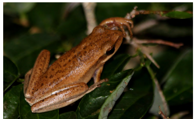
FIGURE 1. Hypsiboas caingua male (FURB 22154) from the municipality of Passos Maia, State of Santa Catarina, Brazil.

Reproductive environments for this species are usually associated with forest clearings or along borders of forests (Carrizo 1990; Brassaloti et al. 2010). Vocalizing males are found on soil or in vegetation, such as grass near water or up to 1 meter high in shrubby vegetation (Carrizo 1990; Brassaloti et al. 2010; Melo et al. 2007). It is also a species