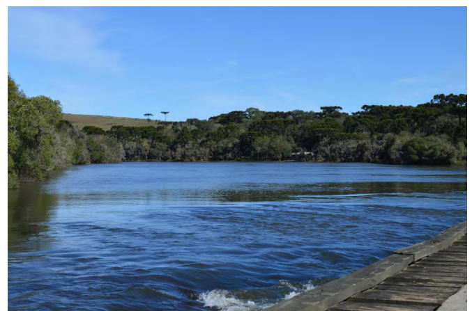
FIGURE 2. The Chapecó River, the location of the record of Hypsiboas caingua , in the municipality of Passos Maia, State of Santa Catarina, Brazil.