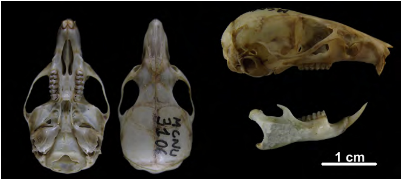
FIGURE 3. Ventral, dorsal, and lateral view of the skull, and lateral view of the jaws of MCNU 3106, adult male – Akodon serrensis collected in the Pró-Mata area, southern Brazil. Scale: 1 cm.

The occurrence of A. serrensis reported here in the area represents the southernmost record of the species. Considering the recent report from Testoni et al. (2012), this record represents an expansion of 177 Km to the south of the currently known limit of its distribution. Bonvicino et al. (2008) reported this rodent to be present in the northern edge of Rio Grande do Sul State, but the authors did not provide voucher specimens nor localities in the distributional map given (Bonvicino et al. 2008: 25). Our findings confirm this approach, and expand the species