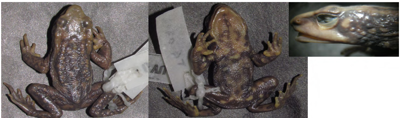
FIGURE 1. Preserved specimen (UVC- 12907) of Atelopus eusebianus , dorsal, ventral and lateral (head) views.SP – State of São Paulo, GO – State of Goiás.

In a review of the herpetological collection of the Universidad del Valle, we found a specimen of A. eusebianus (UVC-12907, Figure 1), collected in 1993 by J.E. Hernández in the Tinajas Páramo (3°21'10.10" N, 76°9'44.76" W), Pradera municipality, Valle del Cauca Department. This location is found on the western slope of the Central Andes, located about 63km north away from the localities known for this species, thus extending its distribution (Figure 2) and confirming the presence of this species in Valle del Cauca. This finding is important due to the Critically Endangered (CR) conservation status of A. eusebianus (IUCN 2012), which has not been registered after the last record made by Valencia and Lopez (2005) on the historical localities where it was abundant (Lopez