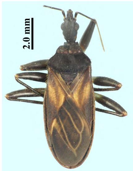
FIGURE 2. Cavernicola pilosa , male from “Feira Nova do Maranhão”, state of Maranhão, dorsal view.

were fully in accordance with these previous descriptions. It should be noted that there were variations in two morphological features of C. pilosa : 1 — a certain degree of variation in color, mainly regarding the brighter corium of the hemelytra (Figs. 1–2), which may otherwise be completely dark in some specimens (Lent and Jurberg 1969); and 2 — “pale chestnut patches” on the anterior lobe of pronotum (Oliveira et al. 2007), which were conspicuously evident in the female examined (Figure 1), but less so in the male (Figure 2).