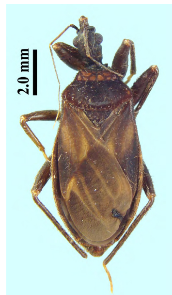
FIGURE 1. Cavernicola pilosa , female from “Feira Nova do Maranhão”, state of Maranhão, dorsal view.

The material examined consisted of a male and a female of Cavernicola pilosa (Figures 1 and 2), collected in a 250 W UV-light trap in December 1991 in the municipality of “Feira Nova do Maranhão”, “Retiro”, 07°00' S, 46° 26' W, 480 m a.s.l., Maranhão State, C. Mielke leg. The material was deposited in the Entomological Collection of “Museu Nacional da Universidade Federal do Rio de Janeiro” (MNRJ), Rio de Janeiro, Brazil. The specimens were identified following Lent and Jurberg (1969), Lent and Wygodzinsky (1979) and Oliveira et al. (2007), and