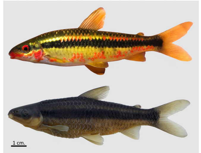
FIGURE 3. Live and preserved (ZVC-P 11583) specimens of L. amae . Scale bar represent 1 cm.

The present records extend the known distribution of