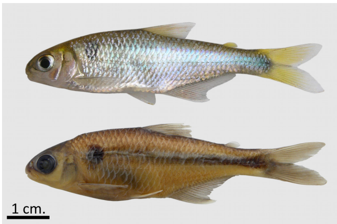
FIGURE 2. Live and preserved (ZVC-P 11592) specimens of H. poi . Scale bar represent 1 cm.

Color in live specimens: Body silver-gray with a horizontal silver band and sky-blue highlights; pectoral fins hyaline, yellowish in the anterobasal portion, and with black chromatophores in the anterior and posterior margins of rays, conspicuous in the first ray; pelvic fins hyaline, white in the anterior margin; dorsal, adipose and caudal fins yellow; anal fin hyaline with dispersed black and red chromatophores, and anterior border white; humeral spot dark; spot in caudal fin base black, less conspicuous than specimens in alcohol, extending into middle caudal fin rays; dorsal surface of head and body yellowish, and upper region of iris dark.