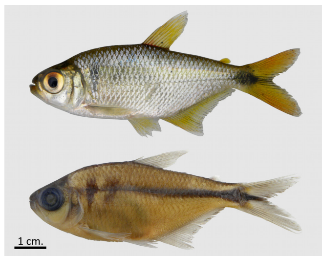
FIGURE 1. Live (ZVC-P 11585) and preserved (ZVC-P 11586) specimens of A. saguazu . Scale bar represent 1 cm.

Specimens were collected in the middle and upper Cuareim River in Artigas Department, and in the upper Arapey River in Salto Department (Appendix 1 and Figure 5).