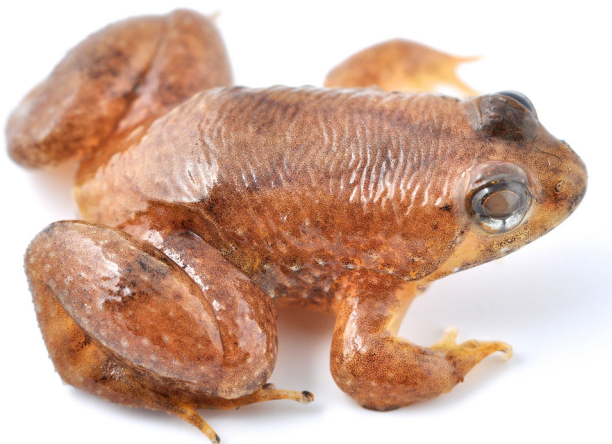
FIGURE 3. Limnonectes rhacodus specimen from Kubah National Park, Sarawak State, Malaysia, Borneo (ZMH A 11641, male, SVL 15.5 mm).