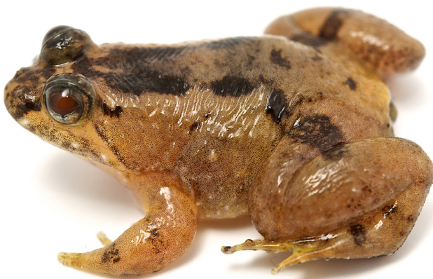
FIGURE 2. Limnonectes rhacodus specimen from Gunung Penrissen, Sarawak State, Malaysia, Borneo (ZMH A 11840, female, SVL 20.1 mm).