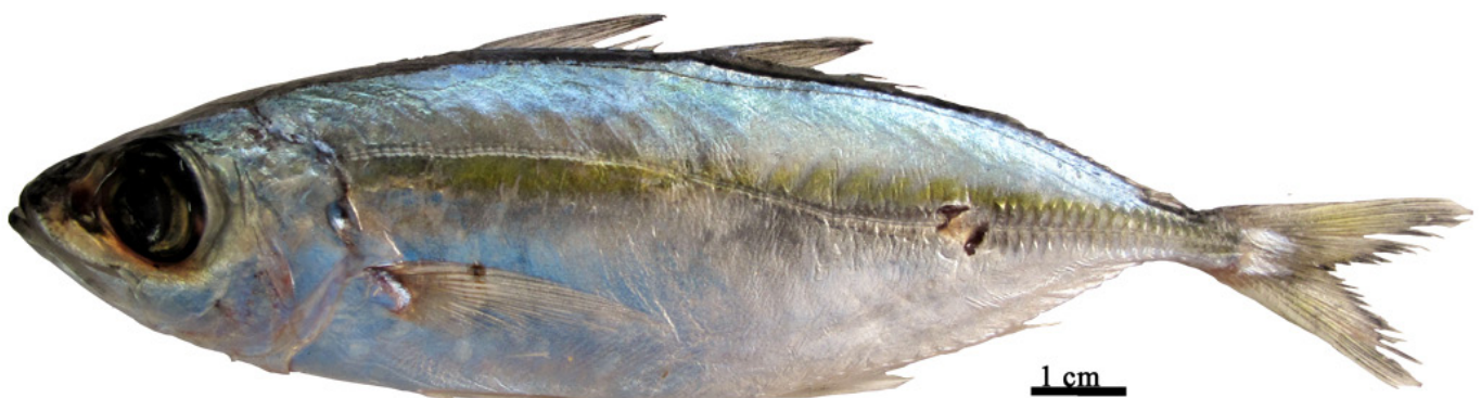
FIGURE 1. Selar crumenophthalmus (FURG n o . 2254/2010) [120.7 mm SL] captured in shallow waters (approximately 5 m) off the southern Brazilian coast.

The marine and coastal ichthyofauna of southern Brazil is relatively well known. Indeed, several studies have been conducted in the region since the 70's, particularly between 1978 and 2005 (e.g., Haimovici and Moralles 1978; Haimovici et al. 1996; Haimovici et al. 2005).