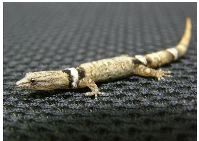
FIGURE 1. Adult male Sphaerodactylus glaucus (FCHU062 photo voucher) from Cerro Hermoso, San Pedro Tututepec, Oaxaca, México.

score (EVS): twelve] for Mexico, based on geographic distribution, ecological distribution, and degree of human persecution. Additionally, Mexican environmental protection laws rate S. glaucus as Subject to Special Protection (Pr) (NOM-059-2010; SEMARNAT 2010). A photographic voucher (Fotocolecta Herpetofauna Universidad del Mar [FCHU062]) of the specimen is deposited in the photographic collection of the Universidad del Mar campus Puerto Escondido. The specimen was captured, photographed, and released under permit number SGPA/DGVS/07772/08, issued by Subsecretaría de Gestión para la Protección Ambiental-Dirección General de Vida Silvestre.