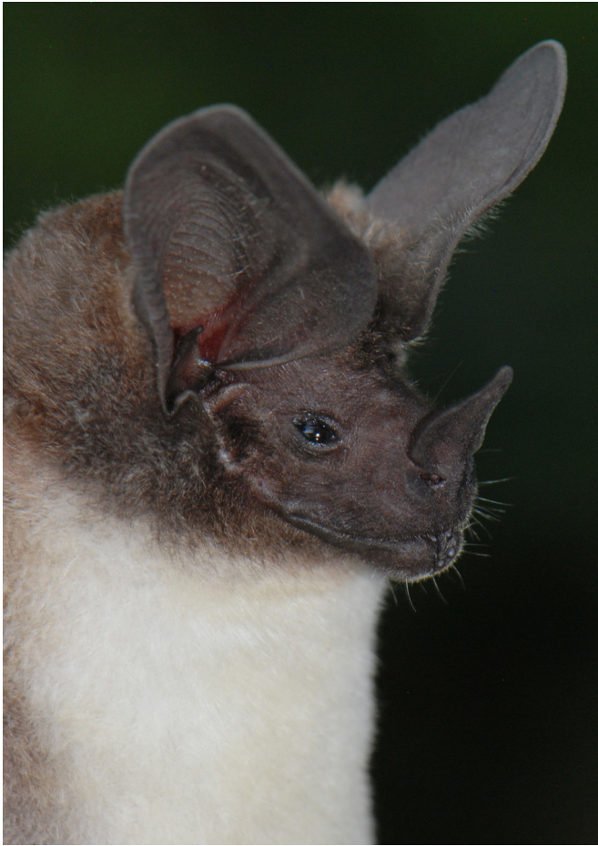
FIGURE 1. Photograph of an adult female Lophostoma carrikeri (QCAZ 13578) from Boanamó, Waorani Ethnic Reserve, near the Yasuni National Park, Orellana province, Ecuador.

The second specimen is an adult lactating female, identified with catalogue number QCAZ 13994; collected on 5 June 2013. The specimen was captured in a mist net along the Ceiba trail (00°40'47" S, 76°23'41" W, 265 m; Figure 2) at the Yasuni Research Station, Yasuni National Park, Orellana province (63.4 km distant from Boanamó). The trail is 1 km in length and loops from the station to the road. The mist net capturing the bat was located 300 m from the road. External measurements are as follows: Total length, 84.0; tail length, 14.0; hindfoot length, 15.0; tibia length, 20.8; ear length, 25.0; forearm length, 44.0;