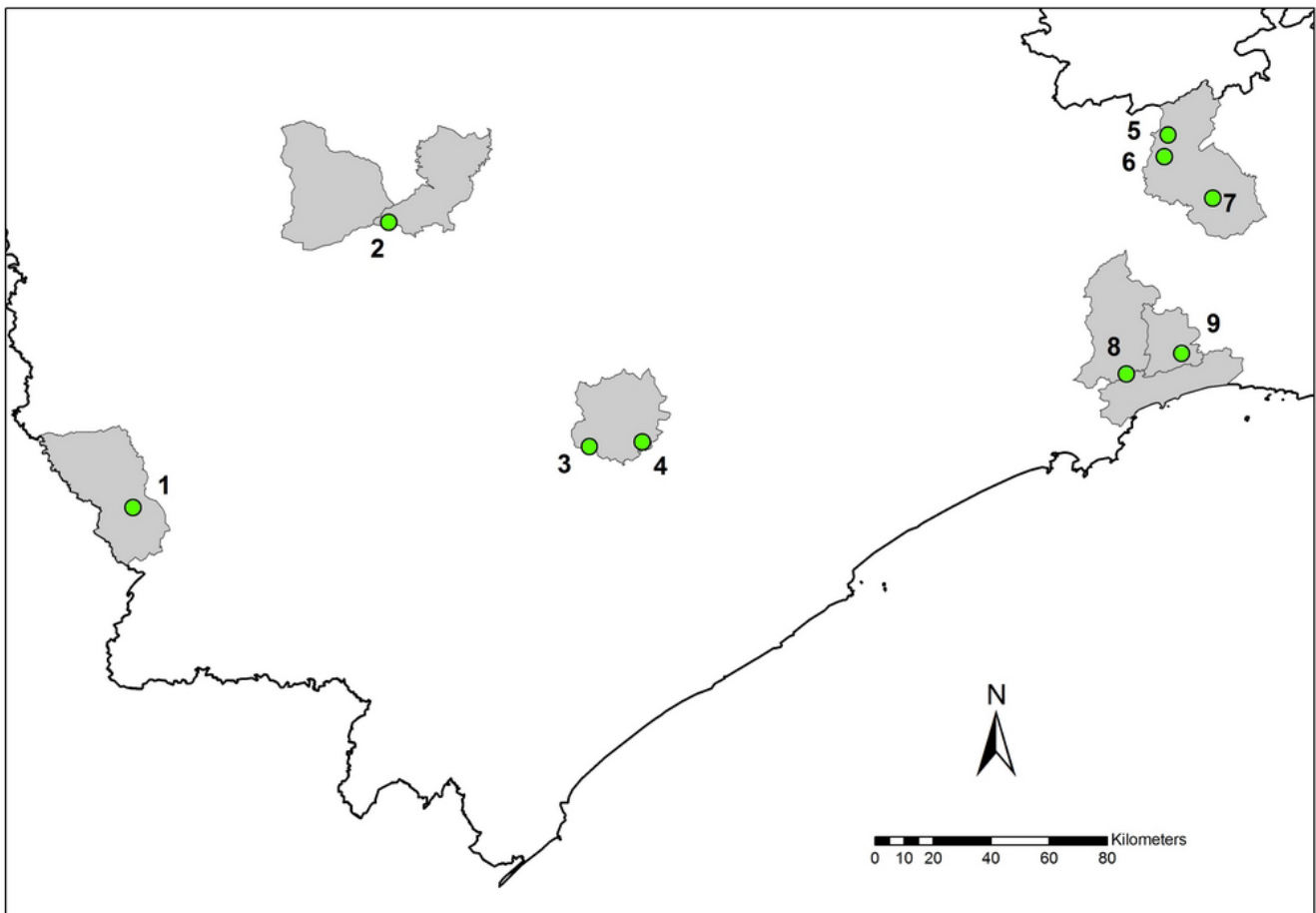
FIGURE 1. Map of the study area in the state of São Paulo, Brazil: 1. Santana Farm; 2. Entrerios Farm; 3. Brumado II Farm; 4. Vitória Farm; 5. Cinco Nascentes Farm; 6. Montes Claros Farm; 7. Central area of São José dos Campos; 8. Parque das Neblinas; 9. Capanhão Farm.

currently dwindling (Machado 2009a). On November 4th 2010, an audio record of the buffy-fronted seedeater was made at BF. On April 8th 2011, an individual was seen and its call was recorded (WA326810) while it moved through a grassland at BF. In the southern state of São Paulo, in the Serra de Paranapiacaba, bamboo flowerings attract many S. frontalis to areas where they were totally absent (Simões 2010). The species was previously recorded in some localities of the Serra de Paranapiacaba. In 1998, it was also recorded at Parque Estadual Intervales (PEI) (Willis and Oniki 2003), which is located in the municipalities of Guapiara, Ribeirão Grande, Sete Barras, Eldorado and Iporanga. In 2009 it was recorded at Parque Estadual Turístico do Alto Ribeira (PETAR), which is located in the municipalities of Apiaí and Iporanga (Antunes and Eston 2010). D. Bucci recently published a photo of a specimen taken at PEI (in the municipality of Ribeirão Grande) ( http://www.wikiaves.com/503983 ). In São Miguel Arcanjo municipality it was recorded at the Parque Estadual Carlos Botelho (PECB) (CEO 2012; Antunes et al. 2013). Recent records were gathered by D. Bete, in the Tapiraí municipality ( http://www.wikiaves.com/766712 ), and by D. Duarte, in the Piedade municipality ( http://www.wikiaves.com/665761 ). Our record is the first record of S. frontalis for the municipality Pilar do Sul.