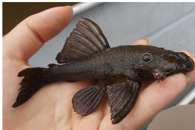
FIGURE 1. Live Ancistrus cuiabae collected in the Vermelho River.

Although occasional collections have been made in the same region where A. cuiabae was found since 1992, this is the first confirmed sighting of this species in Mato Grosso do Sul State. Another individual of the same species was previously collected at the confluence of the Vermelho and Miranda Rivers in September 2011, but the specimen was lost. A great flood occurred in that year in the Pantanal, connecting different environments through waterlogging. Thus, it is possible that this event caused the species to colonize some 360 kilometers from its original distribution range. Alternatively, it could be hypothesized that dispersal may have occurred as a result of release by local bait sellers who sell fish brought by fishermen from various locations in the Pantanal, including the Mato Grosso State. Regardless of the manner of dispersal, this new distribution record for A. cuiabae , as well as the recent description of this species, only reinforces the need to spend more research effort on investigating different regions of the Pantanal in order to learn about and preserve the fish fauna belonging to one of the world's largest floodplains.