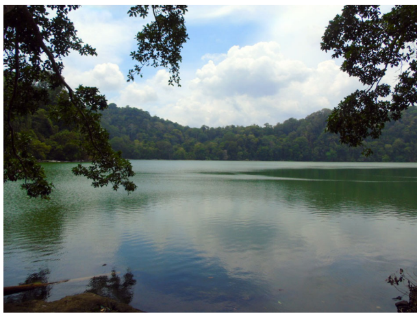
Figure 2. Danau Kastoba location where O. niloticus found in Bawean Island

Identification. Meristic and Morphometric characters of O. niloticus are given in Table 1. Other specific morphological characters are as follows: scales cycloid; gill rakers short; 3 rows of scales on cheek; maxilla and lower jaw equal; teeth widen; pectoral fin pointed; dorsal, pectoral and anal fins blunt; caudal scaly. Coloration: anal fin faintly barred; caudal and soft dorsal fin sharply barred; about 9 narrow dark bars on sides body; dark blotch at corner of operculum.