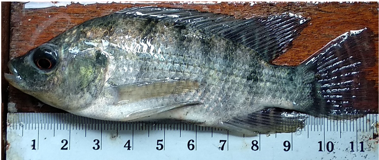
Figure 3. Oreochromis niloticus , Danau Kastoba on Bawean.