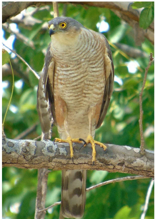
Figure 2. Rufous-thighed Hawk ( Accipiter striatus erythronemius ) recorded in the Inhamum EPA, municipality of Caxias, Maranhão, Brazil.

Our records of A. poliogaster are only the second and third for the state of Maranhão (for the previous record, see Table 1 and Fig. 3 #1). These extends the range in Maranhão of this species by 250 km towards the south.