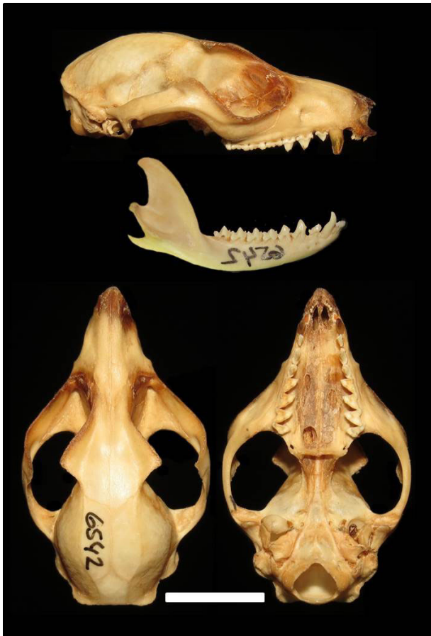
Figure 2. Dorsal and ventral views of the cranium and lateral view of the cranium and mandible of an adult male of Marmosa (Stegomarmosa) andersoni (MUSA 6542), collected in the Quebrada Honda, Huampal, Pasco, Peru. Scale bar = 10 mm.

lower premolar and the lower canine has been previously reported (Solari and Pine 2008), and the present record indicates a greater variation in this character than previously known for the species. Palatal fenestrations are partially perforated, with the right side of the palate fenestrated from the middle of M1 to M2, and the right side from the middle of P3 to the posterior border of M2 (Fig. 2). A throat gland is present, as well as the tail dorsally almost naked but with the presence of bristles ventrally on either side (Fig. 3B). These bristles are brown and short in the basal part of the tail and form a well-developed fringe of long silvery bristles distally (Fig. 3C, D). Pattern of scales of tail ranging from annular to spiral (Fig. 3E). Moreover, the specimen from Pasco (MUSA 6542) exhibits slight differences (less than 1 mm) in some cranial measurements (condyle basal length, minor interorbital, zygomatic breadth, palatal length, palatal width, upper molar tooththrow, maximum width between third molars; see Table 1) that could be considered as intraspecific variation.