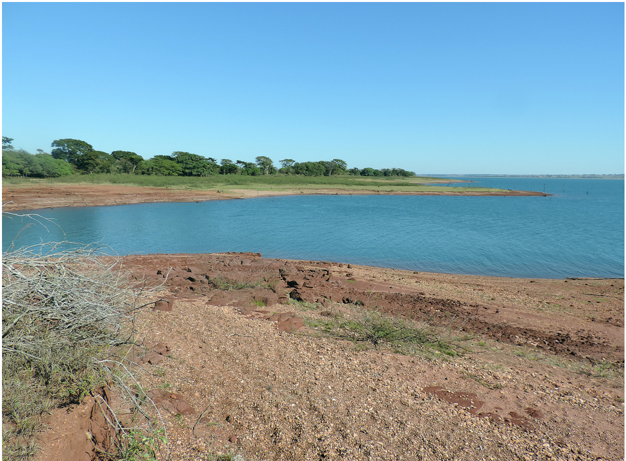
Figure 3. Habitat in Mira Estrela, SP, where Chordeiles pusillus was observed. (Photo: Raisa Rodarte/Casa da Floresta).

that the observed individuals are probably resident in the area. However, these records were made in an area of the Grande river which is susceptible to annual variations in the water level due to the reservoir; fluctuations in the water level can cause the expansion or reduction of habitat availability for the species.