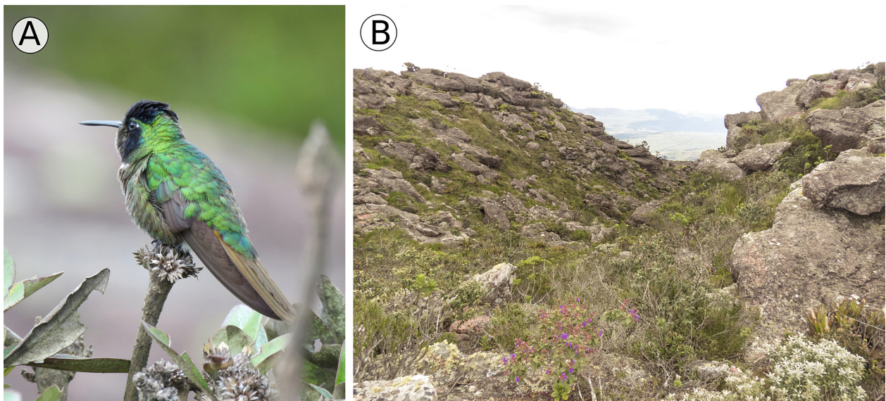
Figure 1. A. Augastes lumachella recorded at the Pico do Barbado, Catolés district, Abaíra municipality, Bahia, Brazil. B. Campo rupestre landscape on Pico do Barbado.

This note reports a new location for a little-known bird species endemic to campo rupestre , an ecosystem that has been neglected as a conservation priority (Silveira et al. 2016). This is the first report of A. lumachella in Abaíra municipality and may be useful for environmental management and conservation strategies for the region, as the Pico do Barbado also harbors a high diversity of plants (Zappi et al. 2003), including local endemics such as Microlicia plumosa Woodgyer & Zappi (Melastomataceae) and Dichantherium barbadense Salariato, Morrone & Zuloaga (Poaceae) (Woodgyer and Zappi 2005; Salariato et al 2011). Although it already has the status of Área de Proteção Ambiental (Environmental Protection