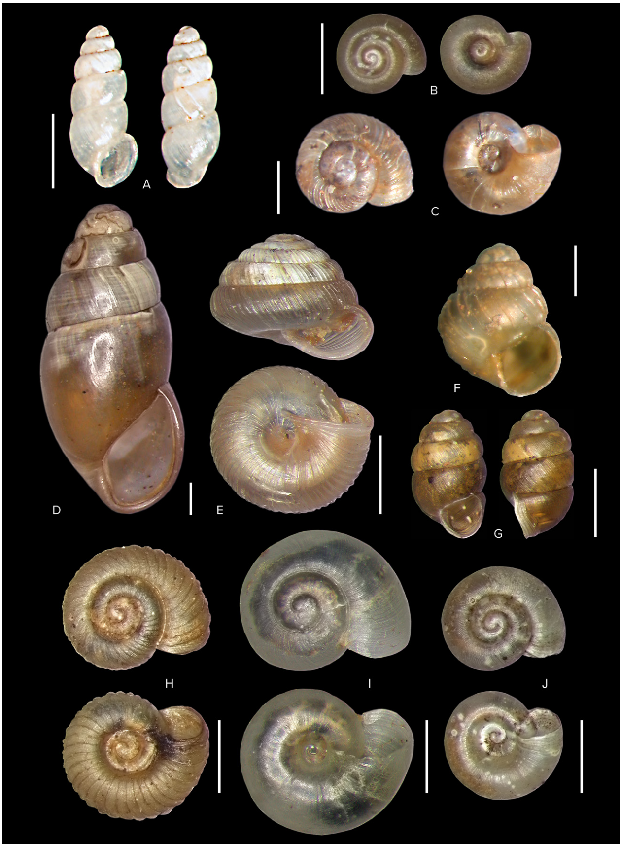
Figure 2. Some leaf-litter dwelling microsnails of Prince Edward Island. A. Carychium exile from South Melville Road, Brookvale, Queens County (NBM-009889). B. Punctum minutissimum from South Melville Road, Brookvale, Queens County (NBM-009895). C. Discus whitneyi from East Point Road, Kings County (NBM-009862), not fully grown. D. Cochlicopa lubrica from Brudenell Provincial Park, Kings County (NBM-009869). E. Strobilops labyrinthicus from South Melville Road, Brookvale, Queens County (NBM-009888). F. Zoogenetes harpa from Mickle Macum Road, Bear River/St. Margaret's, Kings County (NBM-009844). G. Vertigo cristata from Selkirk Road, Queens County (NBM-009887). H. Striatura exigua from North Granville, Queens County (NBM 009850). I. Striatura ferrea from Selkirk Road, Queens County (NMB-009882). J. Striatura milium from North Granville, Queens County (NBM 009849). All scale bars = 1 mm.