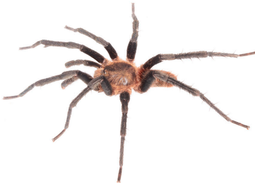
Figure 1. Holothele longipes from the Nemonte Natural Reserve, near Puerto Misahuallí, province of Napo, Ecuador (ZSFQ-i8269); dorsolateral view.

Identification. Morphological characteristics of the examined male specimen (ZSFQ-i8269) match the diagnosis proposed for H. longipes by Guadanucci et al. (2017), showing an elongate, thin bulb with a slightly curved embolus and absence of keels (Fig. 2) (keels present and embolus twisted and sinuous in all other Holothele species; Guadanucci 2020); tibial apophysis composed by two branches, retrolateral branch spine tapering to the apex and placed in the internal profile, prolateral branch with spine from the base (Fig. 2E) (retrolateral branch with two spines, retrolateral spine