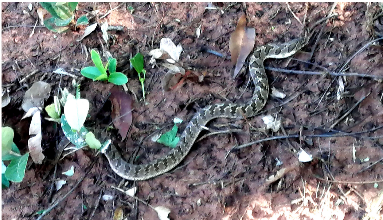
Figure 1. Individual of Xenodon nattereri recorded at the Cerro Corá National Park, Paraguay (not collected).

The individual of Xenodon nattereri recorded by us was found at approximately 30 km from the Paraguayan border with Brazil (Fig. 2) and same distance from the closest known occurrence of this species in Brazil: Ponta Porã municipality, Mato Grosso do Sul (voucher