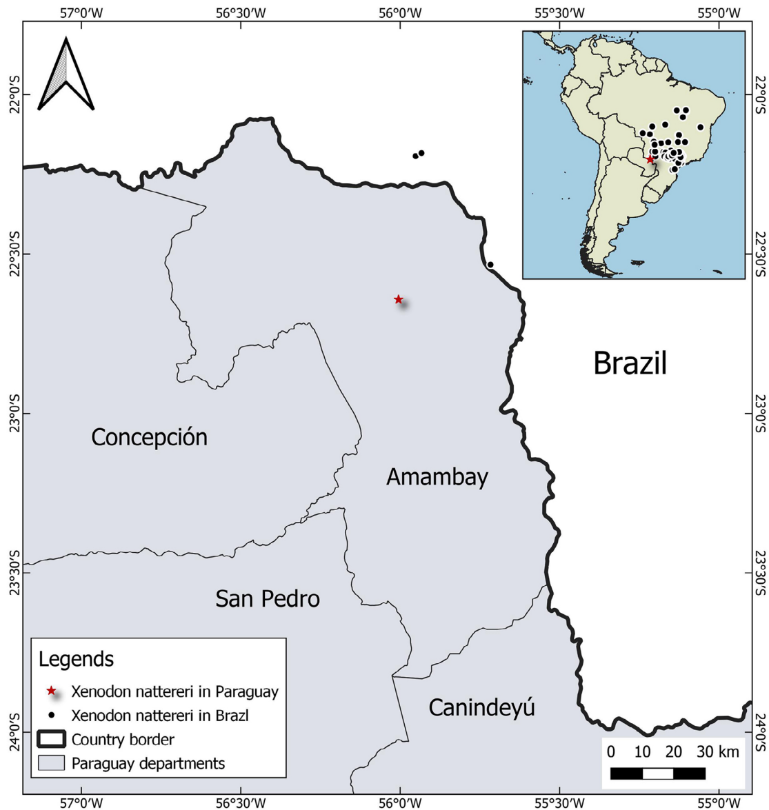
Figure 2. Geographic location of the Paraguayan record of Xenodon nattereri in relation with the closer Brazilian records.

specimen deposited in Instituto Butantan, São Paulo, Brazil: IB 16475). With this new record of X. nattereri from Paraguay, the diversity of snake species known from the country increases to 121, with eight species endemic to the Cerrado. We highlight the value of the two most important protected areas in the Paraguayan Cerrado: Laguna Blanca and Cerro Corá National Park. Laguna Blanca had been a protected area for five years (2010–2014), but it is no longer. However, it still has high conservation value in containing an impressive number of reptiles endemic to the Cerrado (Smith et al. 2016). It was considered the first important area for the conservation of amphibians and reptiles from the Paraguayan Cerrado (Smith et al. 2016), and the second important area is the CCNP, from where there are also many records of species endemic to this ecoregion (Cacciali et al. 2015, 2016). Our record of a newly discovered snake from the Cerrado in Paraguay highlights the importance of maintaining and increasing conservation of this threatened ecoregion in this country.