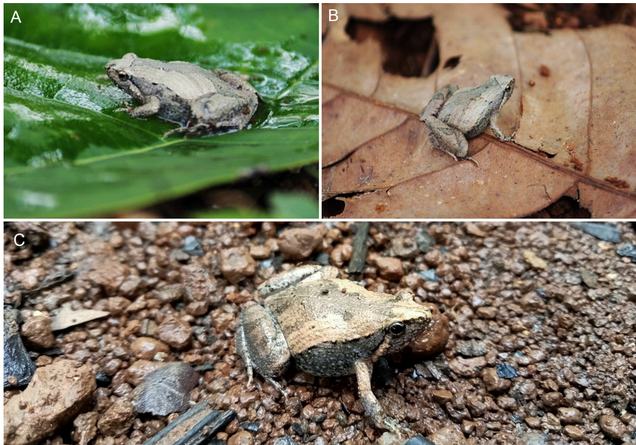
Figure 1. Microhyla gadjahmadai photographed in West Sumatra, Indonesia. A, B. In an open area along a palm-oil plantation road. C. In secondary forest between the conservation area and the palm-oil plantation.

Identification. All observed specimens match the original description of M. gadjahmadai . Snout–nose length 18.2–21.3 mm in adult males and 20.4–25.5 mm adult females. Body stout. Nostril–eyelid length \frac{1}{2} length of snout. Outer palmar tubercle single. Tibiotarsal articulation reaching center of eye. Finger and toe tips dilated. Median longitudinal grooves on dorsum. Toe webbing relatively reduced (free of webbing: 1\frac{3}{4} phalanges on outer surface of second toe, three phalanges on inner and outer surface of third toe, four phalanges on inner and outer surfaces of fourth toe, and 2\frac{3}{4} phalanges on inner surface of fifth toe). Thin, short, dark temporal stripe present over a wider cream stripe, extending from postorbital area to insertion of forelimb (Atmaja et al. 2018) (Fig. 2).