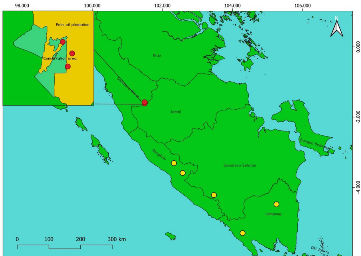
Figure 2. Distribution of Microhyla gadjahmadai in West Sumatra (conservation area and palm oil plantation). Yellow circles indicate the previously known locations (Atmaja et al. 2018). Red circles indicate the new records (this study).