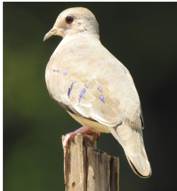
Figure 2. Columbina minuta individual in sunlight showing bluish iridescence on the wings recorded in Porto Velho by Raul Afonso Pommer-Barbosa.

Amazon rainforest could contribute to the presence of the species in Porto Velho.