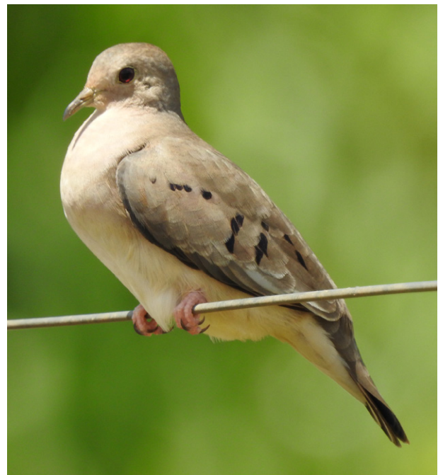
Figure 1. Columbina minuta individual recorded in Porto Velho by Raul Afonso Pommer-Barbosa.

The distribution of C. minuta is still not very well understood in the southwestern Brazilian Amazon (Guilherme et al. 2017). Studies on the ecology of C. minuta indicate that it can adapt very well in open, hot areas (Macario et al. 2021), which suggests that the opening of fields for monoculture and the degradation of the