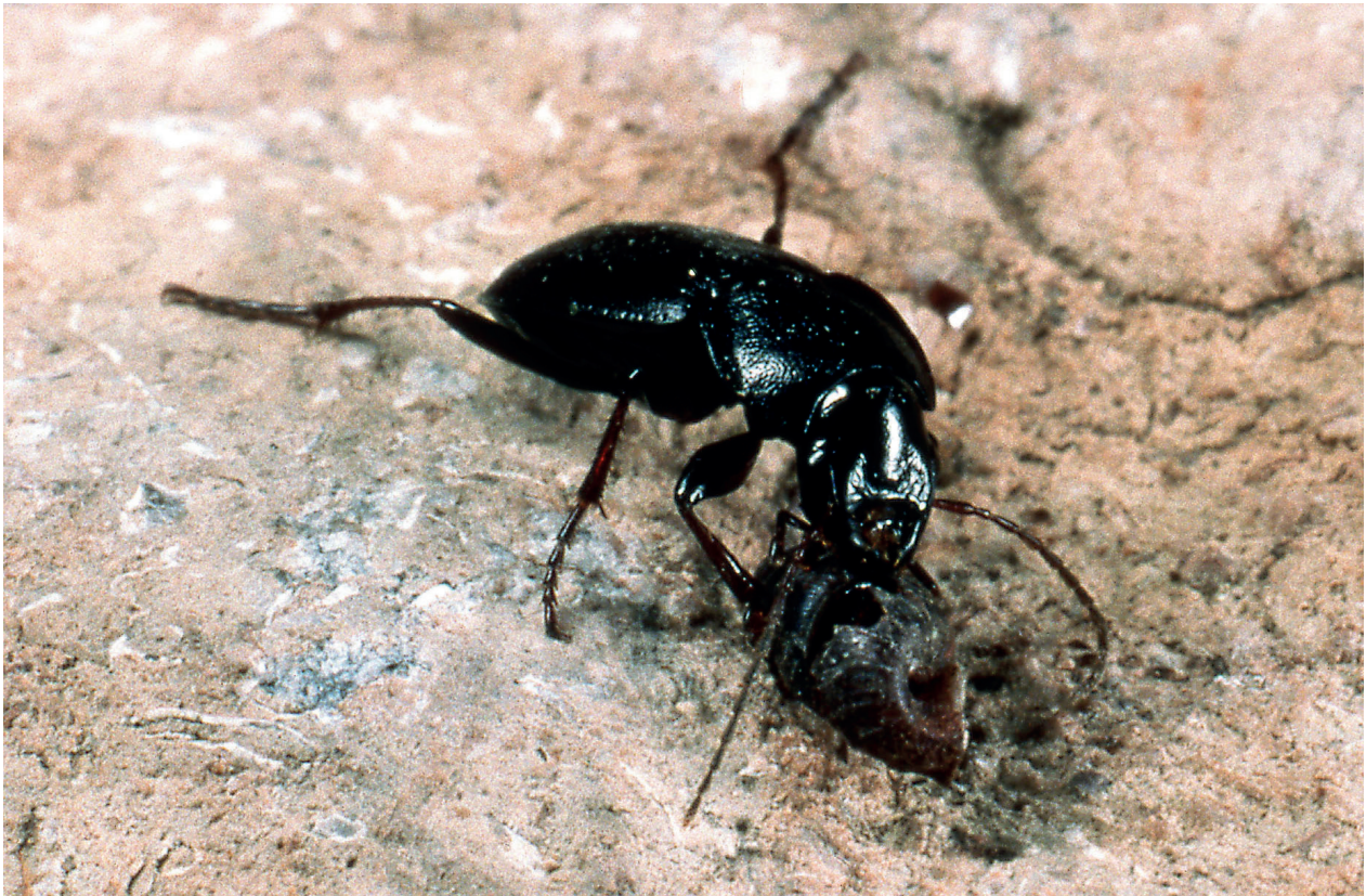
Figure 3. The predatory beetle Licinus depressus interrupts the opening process of the shell and begins to feed on the soft tissue of the prey snail.