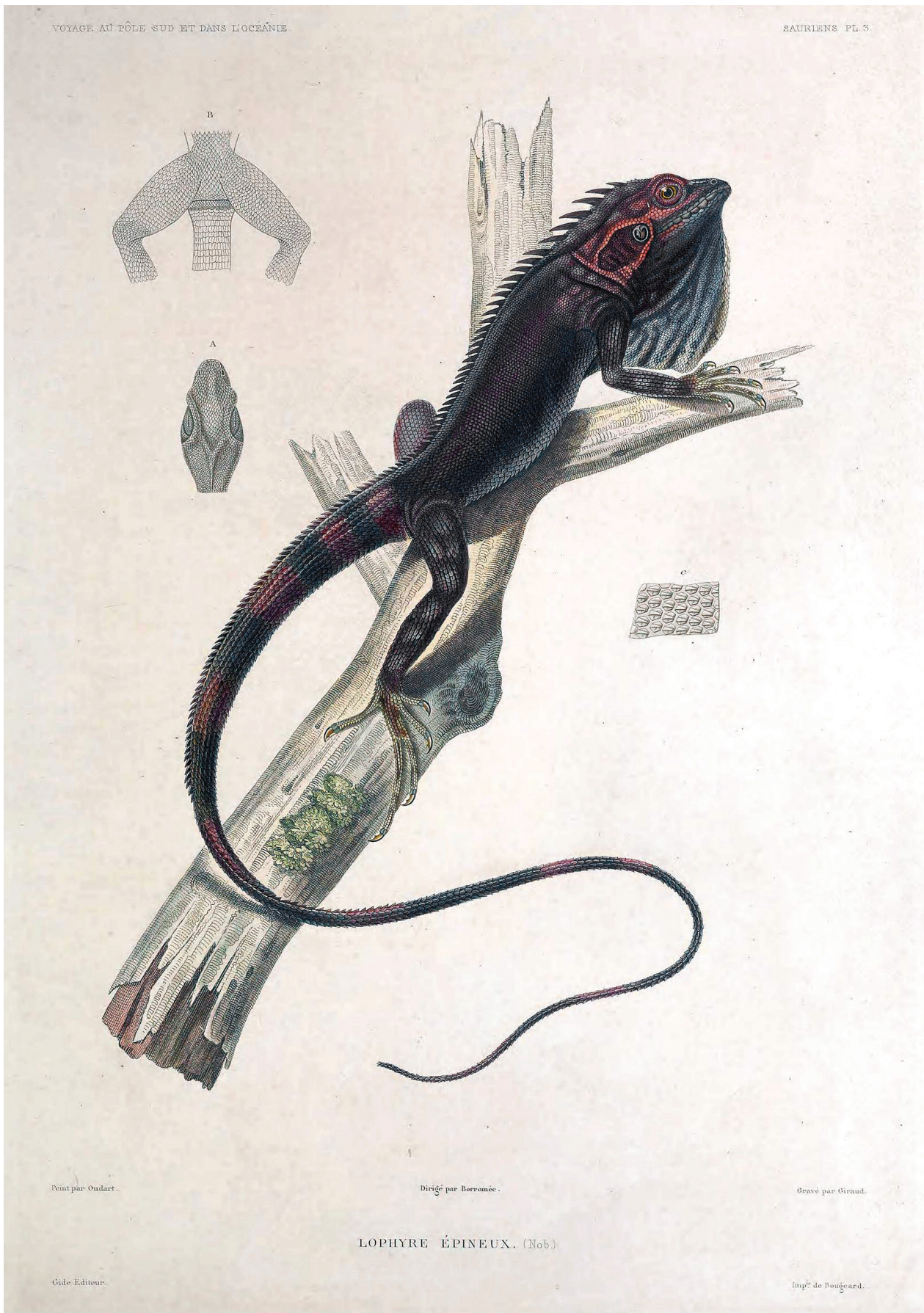
Figure 1. The original plate depicting Lophyrus spinosus as published in 1843.