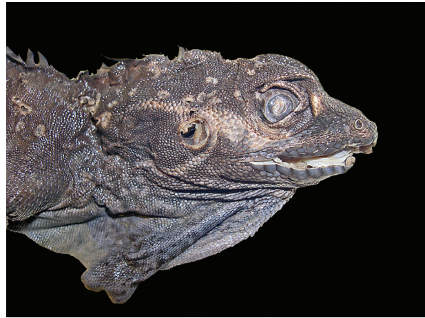
Figure 2. Holotype of Lophyrus spinosus Duméril & Duméril, 1851, valid as Hypsilurus spinosus comb. nov. (MNHN 6896).

brown or turquoise shadings” (see Manthey and Denzer 2016). This shadings or mottling can still be seen in both syntypes of H. auritus (Figure 3) but is not observed in