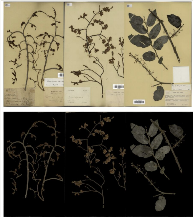
Figure 3. Examples of image segmentation.

Our approach removes the background noise from herbarium scans and extracts clean plant images. It is an important step before using these images in different deep learning models. However, the quality of the extractions varies depending on the quality of the scans, the condition of the specimens, and the paper used. For example, extractions made from samples where the color of the plant is different from the color of the background were more accurate than extractions made from samples where the color of the plant and background are close. To overcome this limitation, we aim to use some of the obtained extractions to create a training dataset, followed by the development and the training of a generative deep learning model to generate masks that delimit plants.