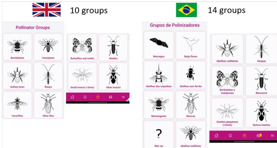
Figure 1. Pollinator groups in the UK and Brazil.

After installation, users may select in which country the observations will be conducted and their preferred language, either English or the main native language of participating countries. The adaptation of the application for use by Brazilian citizen scientists involved not only the translation of the interface, but also relied on the expertise of a local team who helped select which plant species and pollinator groups would be appropriate and representative of biodiversity within the country (Fig. 1). The application is supported by a website that features a dedicated page for each country. Users can download the app on Google Play or App Store (Fig. 2).