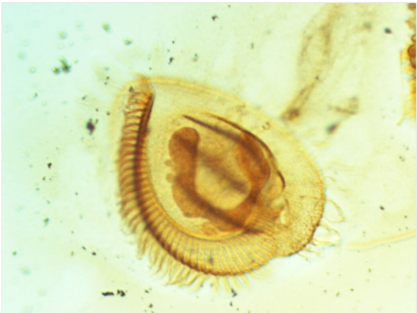
Figure 2. Phacodinium sp. (Class Spirotrichea) from Jalisco, Mexico.