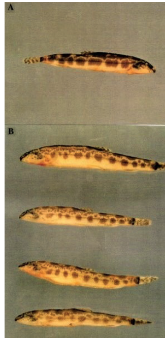
Figure 1. Analysed females of Sabanejewia bulgarica from the Saint George Branch, Danube Delta A individual with colour pattern and high body as described in original description by Drensky (1928) B individuals of S. bulgarica with other colour patterns.

sified according to the system of Levan et al. (1964). The analysed individuals are deposited as vouchers in fish collection of Laboratory of Fish Genetics, IAPG, AS CR, Liběchov (Accs. code. SB 7/97).