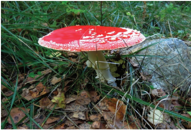
Figure 1. A. muscaria (L.) Lam. in Belasitsa Mountain, Bulgaria.

–11.5(13.1) × (5.6)6.5 – 8.5(9.8) μm and are broadly ellipsoid and inamyloid. Clamps are very common at bases of basidia (Fig. 1).