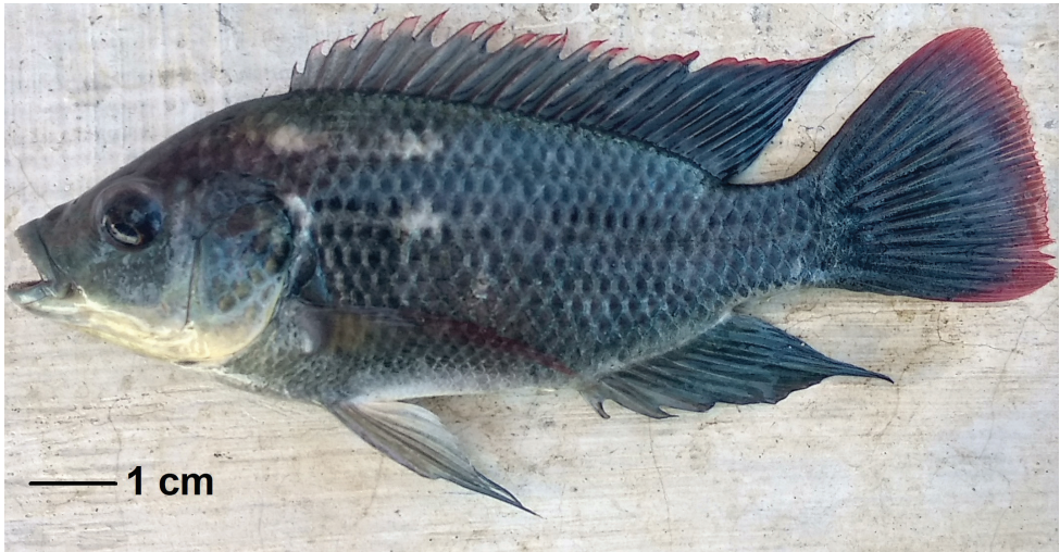
Figure 3. Fixed specimen of Oreochromis mossambicus (Hb.Om.III.2019) found in Kangean Island (Indonesia) in the Java Sea.

liams 1992). Due to aquaculture, O. mossambicus now occurs in all brackish and freshwaters of mainland Indonesia. Its presence on the estuary of Kangean Island, in the Java Sea and 185 km from the nearest mainland (Fig. 3), represents a new record. Estuary conditions on Kangean Island, namely temperature 27–30 °C; salinity 9–25 ppt, depth 0.5–2 m and current velocity 10 cm/s, are ideal for O. mossambicus reproduction and survival (Riede 2004).