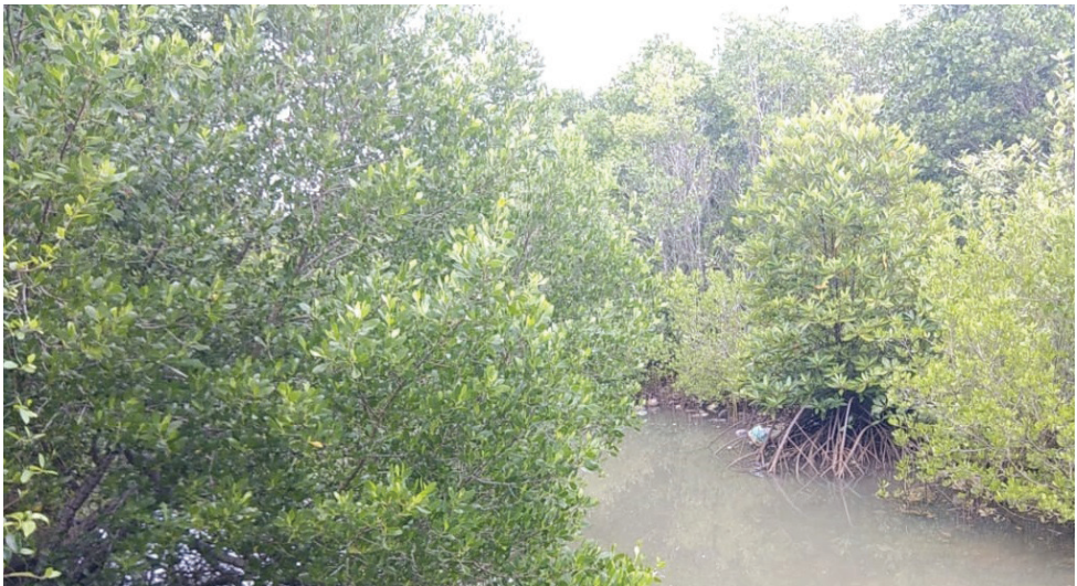
Figure 2. Batu Batu River, location where Oreochromis mossambicus was found on Kangean Island (Indonesia) in the Java Sea.