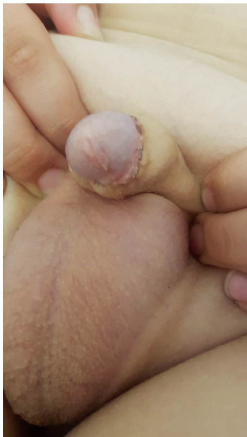
Figure 3. Appearance at a 1-year follow-up after keloid excision.