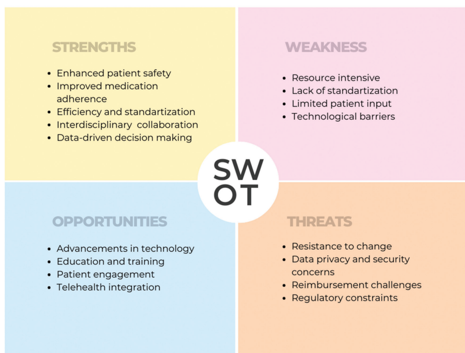
Figure 2. SWOT analysis of the use of medication review tools for managing polypharmacy (created via Canva.com).

The opportunities are related to advancements in technology. Opportunities exist to leverage advancements in