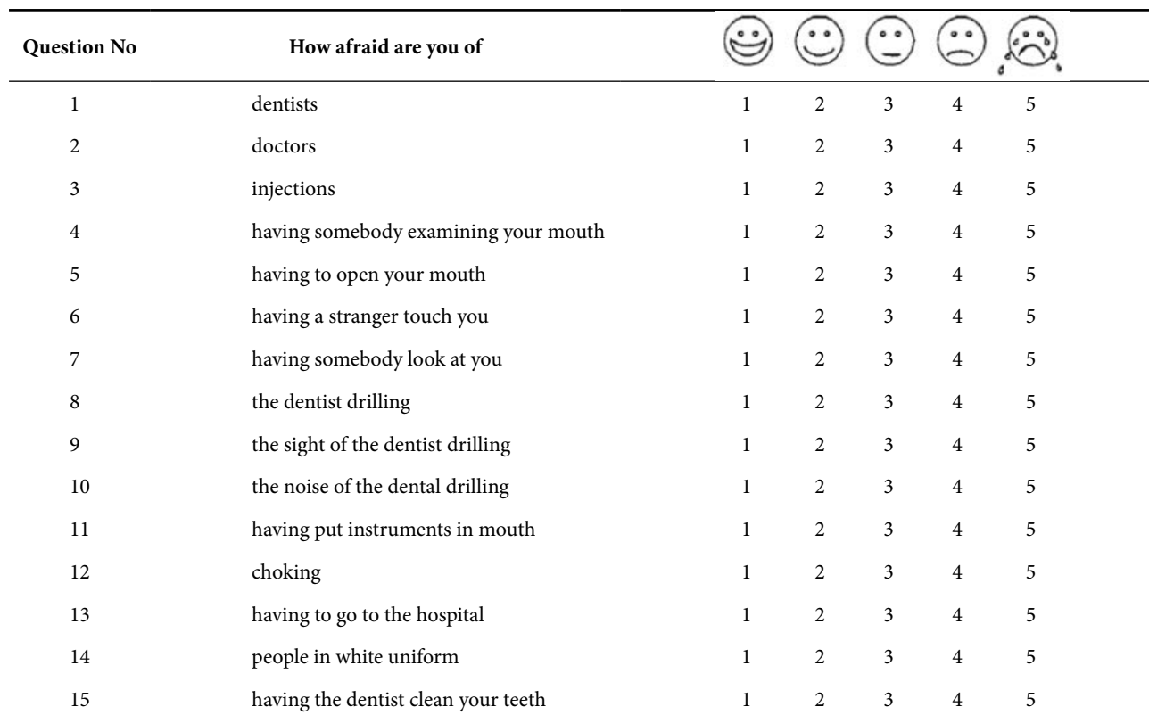
Figure 1. Facial image scale of the dental subscale of the Children’s Fear Survey Schedule.