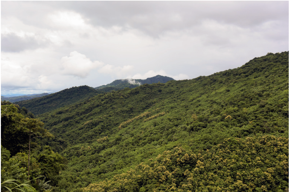
Figure 2. Forests and habitat of Cyclophorus pfeifferi in Dampa Tiger Reserve, Mizoram, India (Photograph by LKS).

Geographically, the north-eastern region of India is part of the Indo-Burma Biodiversity Hotspot and the Mizoram-Manipur-Kachin rainforest ecoregion (Myers et al. 2000; Olson et al. 2001). The latter has a rich biodiversity and acts as a transitional zone for edge species viz. Cyclophorus affinis Theobald, 1858, C. theobaldianus Benson, 1857, C. aurantiacus (Schumacher, 1786), C. speciosus (Philippi, 1847), C. perdix roepstorffiana Godwin-Austen, 1895, C. expansus (Pfeiffer, 1851), C. spironema (Pfeiffer, 1854), C. pyrotrema Benson, 1854, C. pearsoni (Benson, 1851), C. bensoni (Pfeiffer, 1852), and C. zebrinus (Benson, 1836). However, species Cyclophorus affinis , C. aurantiacus , C. theobaldianus , C. zebrinus , C. bensoni , C. expansus and C. speciosus have long-distance dispersal abilities within