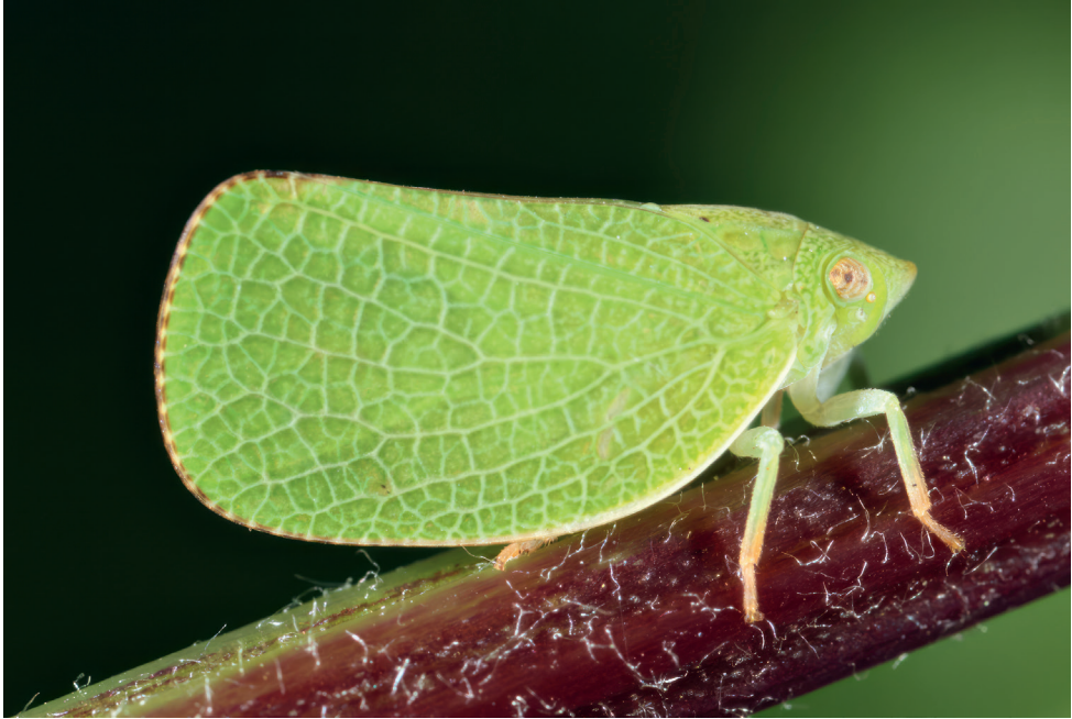
Figure 3. An adult of Acanalonia conica , Malko Tarnovo, 19.08.2022.

In both countries, Bulgaria and Türkiye the localities are in urban environments – two in the town of Malko Tarnovo and one in Istanbul. Due to the data from Türkiye (Istanbul) being based only on photos published in iNaturalist, additional information on the species' biology is missing, including its host plants.