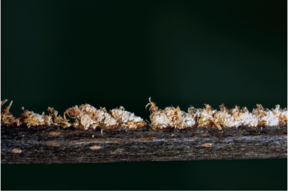
Figure 5. A branch with Acanalonia conica eggs on Amorpha fruticosa , Malko Tarnovo, 19.08.2022.

distribution, it is expected to be found in many other ruderal sites, and its mass reproduction may cause damage to park or ornamental plants.