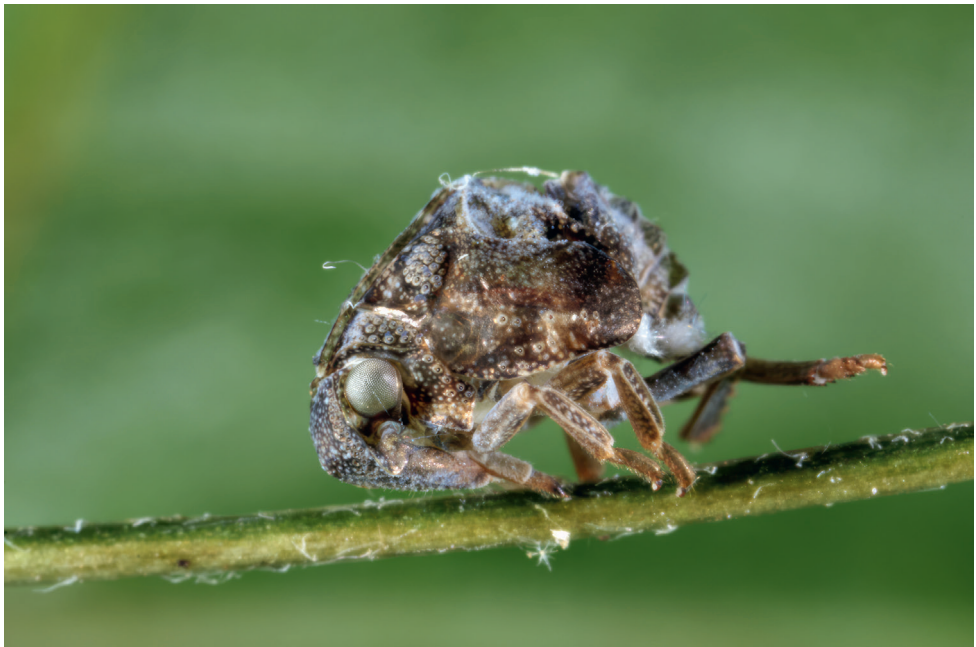
Figure 4. An exuvia of Acanalonia conica , Malko Tarnovo, 19.08.2022.

Based on the literature and new data, it can be concluded that since its initial introduction into Europe, the species has mainly adhered to ruderal habitats without causing serious damage to agricultural or wild plants. However, given its known