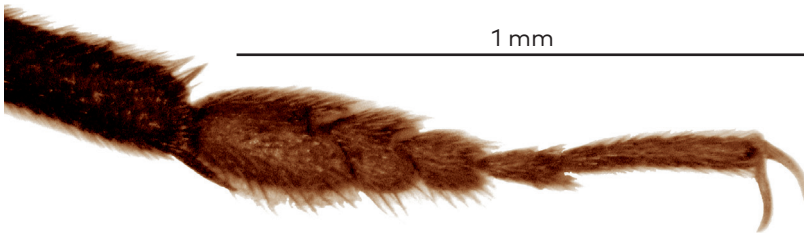
Figure 3. Protarsus of Choleva macedonica (Comarnic Cave, the Carpathians, Romania).

Abdominal sternites regularly convex, without medial depression.