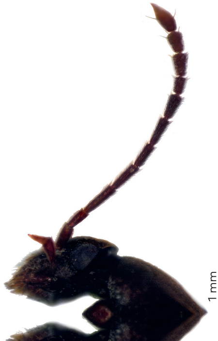
Figure 2. Head and antenna (lateral view) of Choleva macedonica (Comarnic Cave, the Carpathians, Romania).

Metatrochanter elongate, pointed apically, without postero-basal tooth and with straight posterior margin (Fig. 4).