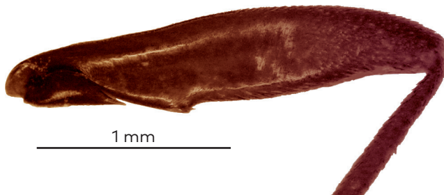
Figure 4. Metafemur and metatrochanter of Choleva macedonica (Comarnic Cave, the Carpathians, Romania).

However, the rarity of the specimens observed so far (all findings) does not allow us to raise, at this moment, the new discovery from the Carpathians to the level of a new subspecies. Future studies, based on a larger number of specimens, will be able to resolve the subspecies status of this taxon. For this, we have provided the detailed description of this male specimen from the Carpathians.