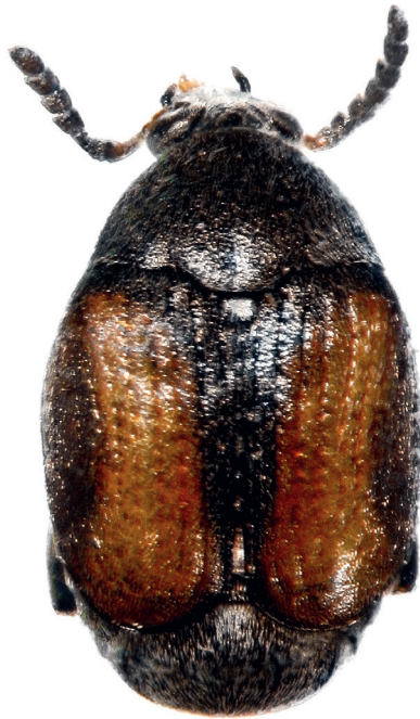
Figure 1. Habitus of Stator limbatus (Horn, 1873), male, dorsal view.

Maps were created using QGIS Version 3.18.2 free and open source Geographic Information System ( https://qgis.org/en/site/ ).