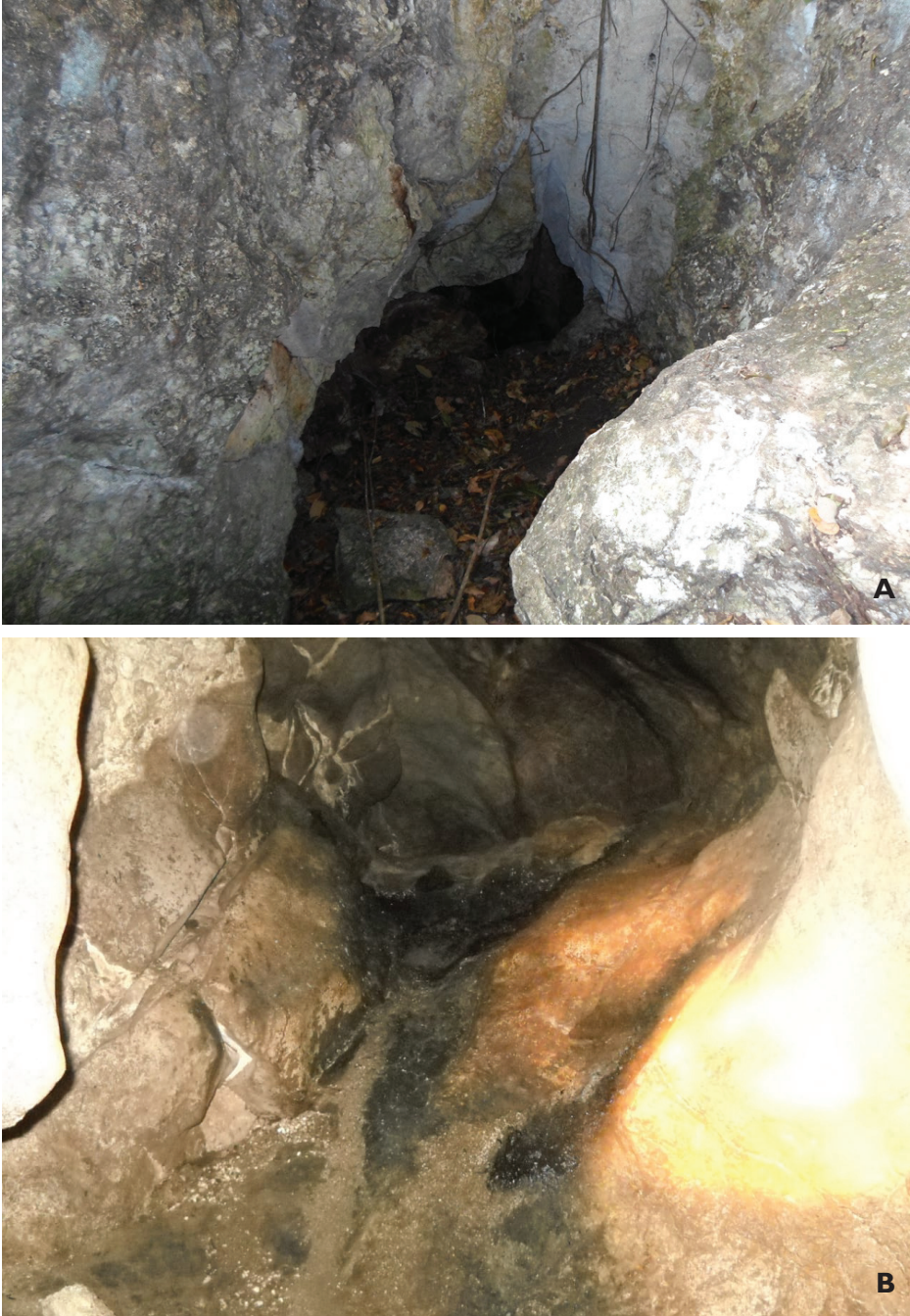
Figure 3. A the main entrance of the cave of Monte Grueso is a climb of approximately 5 meters drop. The inside of the cave is divided into tree branches. The photo was taken by Hefer Ávila B main branch of the cave, which is often used by the bats whenever they entered or exited the cave. Notice the guano in the floor of the cave of hematophagous bats ( D. ecaudata and D. rotundus ). The photo was taken by Manfredo Turcios Padgett.