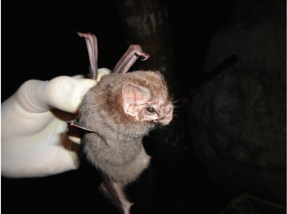
Figure 7. Adult female of Diphylla ecaudata captured in the cave of Monte Grueso when leaving the cave for searching food. The shelters of this unstudied species in Honduras in Monte Grueso could represent an important site for their conservation.