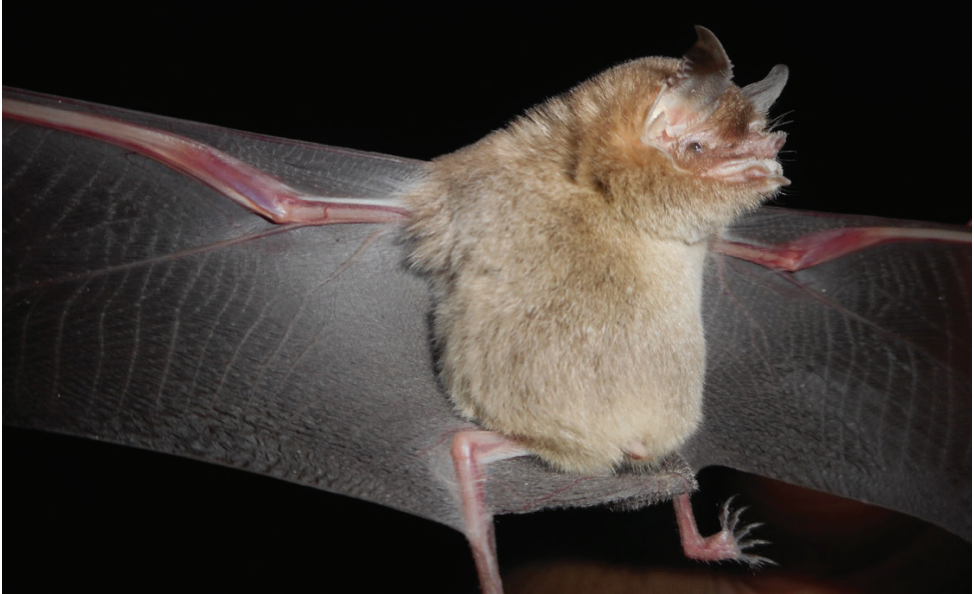
Figure 5. Pregnant female of Pteronotus personatus in the Cave of El Peñón during the survey of May 8, 2016.