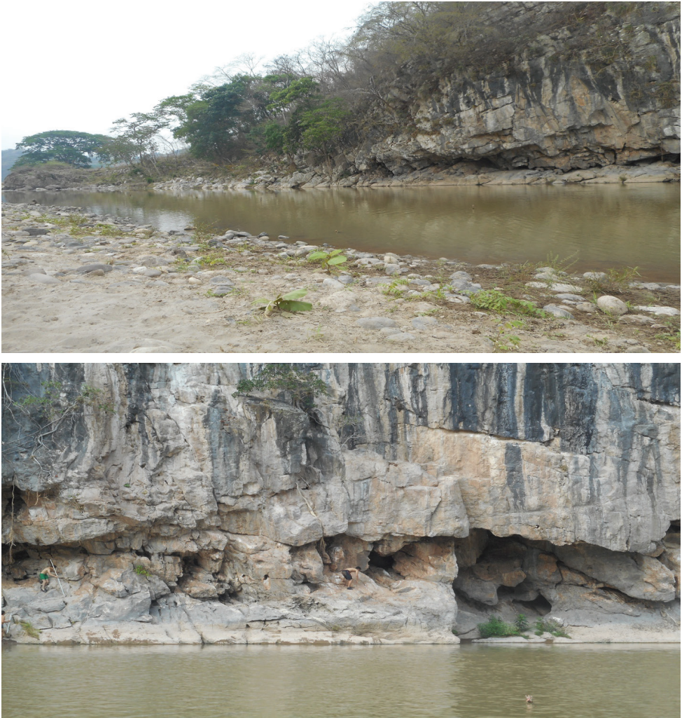
Figure 4. Caves of El Peñon are located riverside of Río Ulúa. This agglomeration of 7 caves is located riverside of the Río Ulúa. During the surveys we found an owl (Strigidae) coming out of the cave when the activity of the bats (18:00) started, and also, we found remains of the food belonging to a presumably Chironectes minimus (Didelphidae), that use rocks of these caves to eat fishes.

is estimated that 35,000 bats inhabit on it, and still is the biggest aggregation of bats in a natural refuge for Honduras.