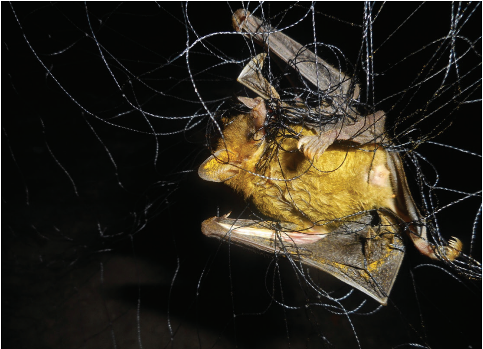
Figure 6. An adult female of Glossophaga soricina returning to the cave of Monte Grueso after the pollination of certain species of plants. During these surveys, we found trees with opened flowers of Crescentia alata (Bignoniaceae).