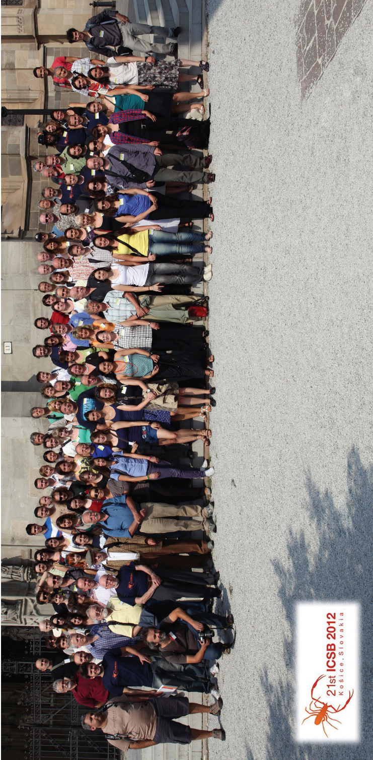
Figure 1. Conference participants.