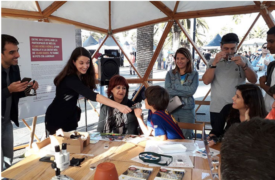
Figure 1. Citizen Science space at Barcelona Science Festival

From its inception, the Office has focused on disseminating citizen science. Actions include publishing a projects catalogue in 2015 “Citizen Science, 20 projects to make a city” (Oficina de Ciència Ciutadana de Barcelona 2015), organizing the Citizen Science Day, integrating projects into major city events like the “Riu Besós Day”, hosting a dedicated space for citizen science at the annual Science Festival (see Figure 1), and incorporating participatory sessions and projects in the three editions of the City and Science Biennial.