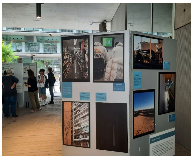
Figure 2. Photo-Voice exhibition from the TrackU project.