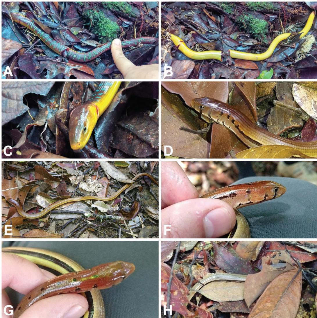
Figure 3. Dopasia buettikoferi from Borneo. A–C: individual from Gunung Sio, Sarawak. (Fig. 2 loc. 9). D–E: individual from Gunung Trusmadi, Sabah (Fig. 2, loc. 10). F–H: individual from Segerak Research Station, Sarawak (Fig. 2, loc. 6) and its microhabitat.

neo (3.133N, 115.243E, 1268 m elev.; Fig. 2, loc. 9). This record is close to that of Asad et al. (2015), but represents the highest elevational record known thus far for the species (Table 1). The individual was found on 16 October 2015 at 15:37 hours and had been killed by local people (Fig. 3A–C). The specimen possessed a different phenotype compared to other known specimens of D. buettikoferi and more closely resembled D. gracilis or D. harti from mainland Southeast Asia (Brygoo 1987). Although the specimen was not collected, from the photographs it is evident that the head is elongated and the colouration of the dorsum and ventre are distinctly different. The ventral colouration is uniformly yellow from the chin to the tip of the tail while the top of the head and back are dull brown and the tail is reddish–brown. On top of the back are a number of blue dots scattered from the neck to the tail. The individual was an adult, estimated to be 40 cm in length (Fig. 3A–C).