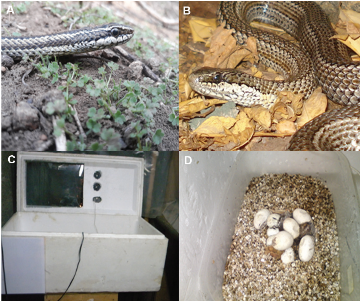
Figure 1. Adult specimens of Philodryas chamissonis . A male. B female. C, D Incubator with Philodryas eggs.

four ecdysis events and biometry of P. chamissonis neonates was recorded for 9 months (Table 1). Neonates of P. chamissonis performed ecdysis every 64 to 66 days, which lasted between 6 and 8 days. Two neonates (P1 and P2; Fig. 3C) with a high initial total length (220 mm vs 210 mm) were observed. Interestingly, the increase in the average total length correlates ( r^2 = 0.9979 ) with the ecdysis number (Fig. 3D) but not the average weight ( r^2