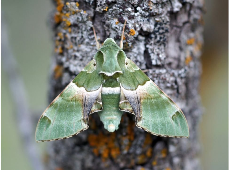
Figure 27. Akbesia davidi (Oberthür, 1884)