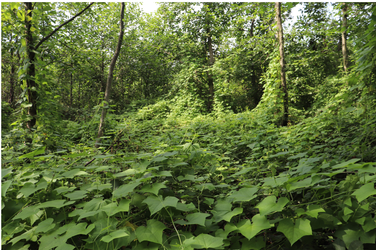
Figure 1. Sicyos angulatus climbing all over the Alnus barbata trees in disturbed areas of the Chorokhi Delta.

According to Vasilchenko (1975) Sicyos angulatus was distributed in the European part of the USSR, namely the middle and upper parts of the Dnieper River basin and the Volga-Don Canal. According to the same source, Ledebour (1844) indicates the genus for the Caucasus, but later the fact was not confirmed. The first specimens of S. angulatus were found in Georgia in 2012 on agricultural areas in the valley of the Chorokhi River (41°31.710'N, 41°42.820'E; 41°30.262'N, 41°42.690'E; 41°33.934' N, 41°39.688' E) reported by Mikeladze et al. (2015). Later, new localities were found both in agricultural lands and in semi-natural communities. Thus, Sicyos is a recent addition to the Georgian flora and the aim of the presented contribution was to study the distribution characteristics of this alien species in west Georgia.