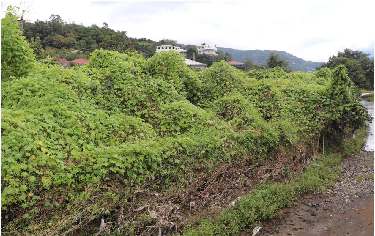
Figure 3. Sicyos angulatus climbing citrus shrubs on agricultural lands near river.

at each invaded site increases to 90-95%. It climbs over every plant encountered and hinders its development (personal observation). In agricultural croplands: maize fields and citrus plantations, it significantly reduces the qualitative and quantitative characteristics of the harvest. Another problematic property of S. angulatus is its spiny fruits, as they cause human skin irritation upon touch. The species expands its distribution area with each subsequent growing season. The climatic conditions of west Georgia are advantageous for the continued invasion of S. angulatus , which increases harm to agricultural lands and already disturbed communities, and becomes more noticeable every year.