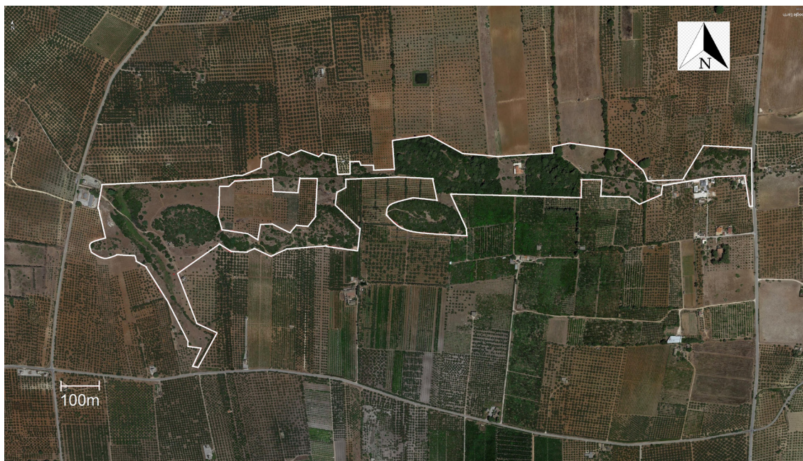
Figure 2. The site of ‘Parche di Bilello’ (source: Google Earth). White line = perimeter of the area where the floristic inventory was carried out; its protection as a new Site of Community Interest is here recommended.