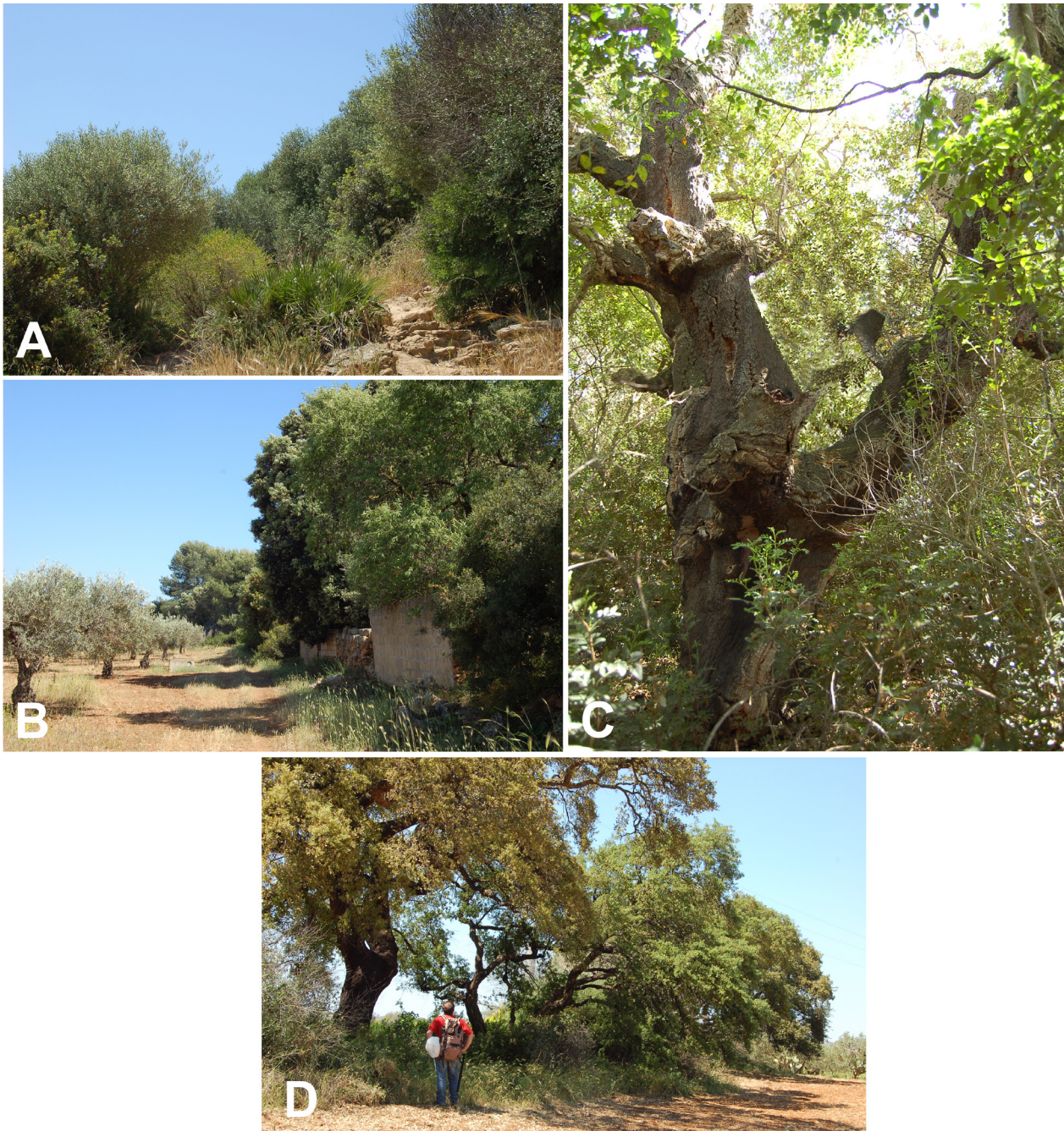
Figure 5. A, Evergreen maquis-forest nucleus referred to the Chamaeropo humilis-Oleetum sylvestris acanthetosum mollis (Habitat 9320) (photo: L. Gianguzzi, May 9, 2007); B, Forest nucleus dominated by Quercus ilex (Habitat 9340) (photo: L. Gianguzzi, May 9, 2007); C, Century-old tree of Quercus suber (photo: L. Gianguzzi, May 9, 2007); D, Forest strip dominated by Quercus suber (Habitat 9330) (photo: L. Gianguzzi, May 9, 2007).

munity described from the Erei Mounts (southeastern Sicily: Barbagallo 1983; Brullo et al. 2009 and references therein). Even if the main characteristic species of this association, i.e. Aristella bromoides (L.) Bertol. – also known as Stipa bromoides L. – was not observed in the study area, it has been recently reported to occur at Menfi and Castelvetrano (Scuderi and Pasta 2009) in other remnant fragments of open forestland once covering the Basso Belice lowland (see Table 6, relevé 3, from Scuderi 2006).