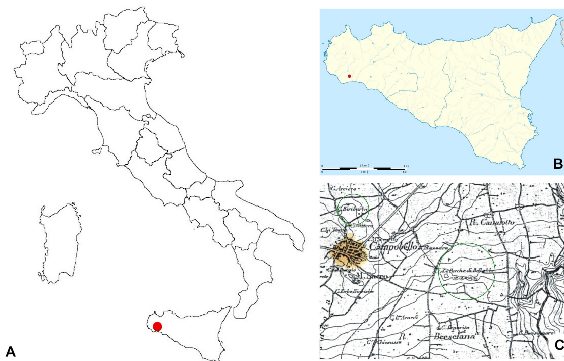
Figure 1. Location of the study area with respect to Italian (A) and Sicilian (B) territory; C) the study area and its close surroundings: particular from ITMI (1872, original scale 1:100,000).

The almost flat coastal landscapes between Sciacca and Marsala are usually called Sciare, a vernacular term which seems to derive from the Arab word 'sha'raa' (= sterile and uncultivated area). Agricultural activities are difficult here due to poor soil availability. The term 'Sciare' has been broadly used to indicate local karst flatlands, characterized by a mosaic of outcropping calcareous rocks and sandy-loamy shallow lithosols supporting a mosaic-like patchwork of thermo-xerophilous vegetation including therophytic swards, perennial dry grasslands, garrigues and low maquis. The Sciare also host several small temporary ponds and rock pools rich in hygrophilous and