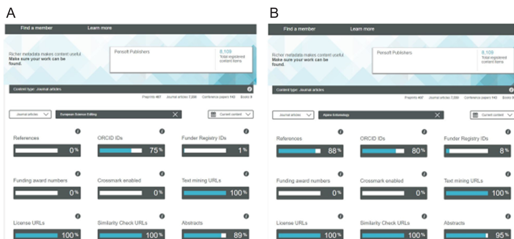
Figure 1. (A) Crossref participation report for European Science Editing [cited September 6, 2023]. Available from: https://www.crossref.org/members/prep/2258 after inputting journal articles from European Science Editing . (B) Crossref participation report for Alpine Entomology [cited September 6, 2023]. Available from: https://www.crossref.org/members/prep/2258 after inputting journal articles from Alpine Entomology . Use of Crossref participation reports for 2 journals was permitted by the Crossref.

In Table 4 of Ansorge’s article, which presents articles citing European Science Editing and indexed in Dimensions but not in Scopus, a footnote was added. The footnote indicated that the source was indexed in Scopus but not the specific article in Neurointervention (10.5469/neuroint.2022.00493). However, I conducted a search in Scopus and located the article on August 7, 2023. Therefore, considering the short period between the publication