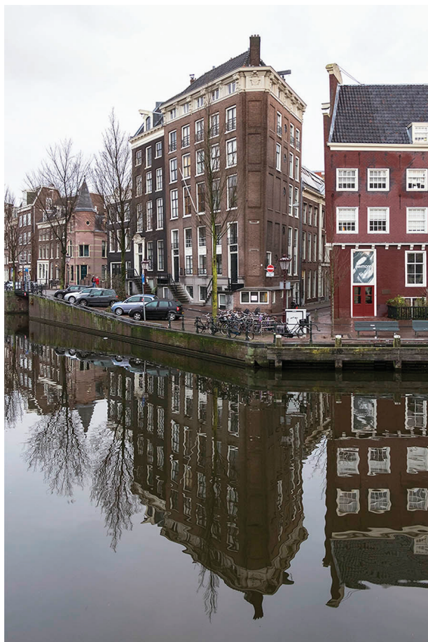
Figure 1. The Building Herengracht 401.

was a constituting feature of the group. After the war, the group needed internalisation of the group-defining forces that used to come from the outside to stay together as an alternative community. The war-time trauma was sublimated with a cult to maintain the feeling of togetherness and belonging only to bring back the pain much later in another shape and form. 2 With critical distance in time and space, some eyewitnesses were able to identify their pain as trauma. The complexity of the history in which it is rooted is so dense, that distance in time and culture makes it difficult to understand and empathetically connect with this history in a straightforward, unmediated way.